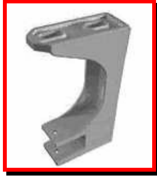
Soffit (Overhang) Bracket

NEVER INSTALL THE MOUNTS TO FACIA BOARDS OR MOLDINGS